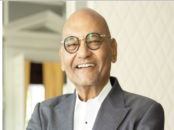
'karmabhoomi', Mr. Agarwal reiterated, "Vedanta is fully committed to support Rajasthan and its leadership to achieve new heights for this amazing state."

Vedanta Group, through Hindustan Zinc Limited and Cairn Oil & Gas (HZL), has been a key player in harnessing this mineral wealth sustainably. Vedanta's extensive operations across Rajasthan, have made the state a global hub for zinc, silver and oil & gas production. Calling Rajasthan his