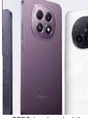
OPPO has launched the F29 Series, designed for India's working professionals, combining durability, performance, and advanced connectivity.