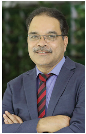
small finance bank, operating