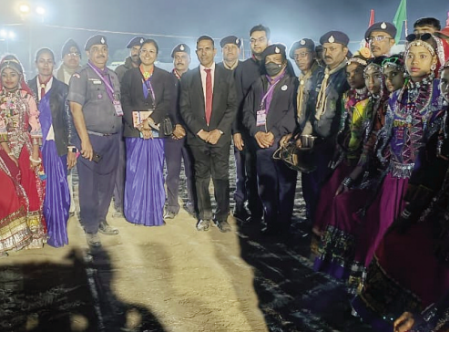
Udaipur Collector will arrange free milk for all children in Jamboree:

eration. During this, the collector made a help desk for the convenience of the visitors, set up a control room, kept a team of Forest and Animal Husbandry department ready, appointed all division-level officers for the work arrangements of Jamboree for the next two days, drone security.