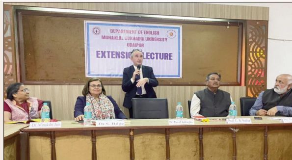
Culture and Literature, Turkey spoke about "Drawing Life: American Women