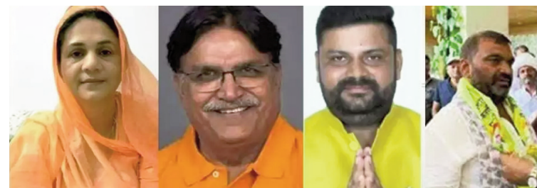
Congress has done damage control.