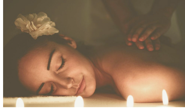
There is promising scope for Wellness Tourism as per Global Wellness Tourism, which it predicts to rise up by 7.5 per cent till 2022, a higher number than 6.4 per cent

economy boosting wellness tourism zone in the State. The province is expecting to receive tourists at a competitive figure if compared with India's other active Wellness Tourism areas. Some of these are Taj Hotels of IHCL that launched Wellness Retreats in past year in some of its hospitality units of India to host health retrieving tourists. They offered medically advised immunity enhancing food items for the guests. Ananda Spa Resort, Rishikesh started daily 90-minutes online Yoga and Meditation Time in the past days of Covid pandemic for its guests.