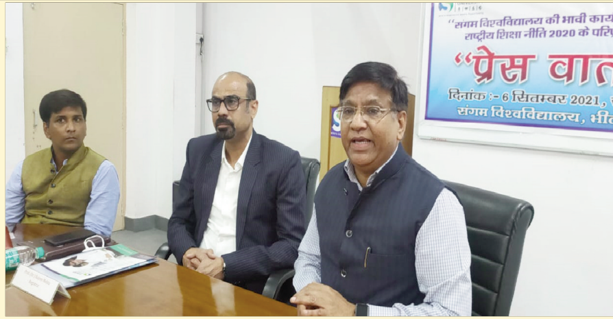
Registrar, Sangam University said that Skill Development Centre and Entrepreneurship Development Center will be set up soon in Sangam University. There are 38 Sector Skill

Councils functioning in the country under the Kaushal Vikas Yojana. Sangam University is also planning to originate several programmes run by them.