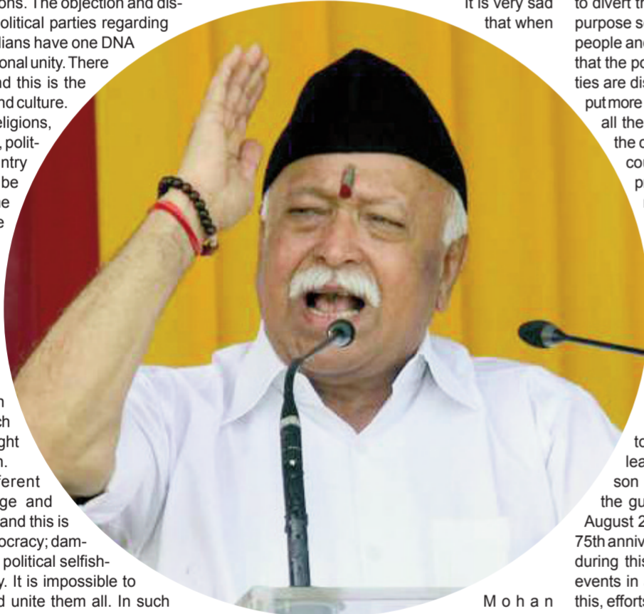
M o h a n Bhagwat, the

head of the world's largest non-political organization, is emphasizing on Hindu-Muslim unity, then some leaders are making extra efforts to ensure that our society does not pay attention to such things of solidarity-goodwill. From this effort it was revealed that some people are interested in the distance between Hindu-Muslim should not end. In this context, the Sangh chief rightly said that the talk of Hindu-Muslim unity is misleading in the sense that they are already united and it is not correct to see them as separate.