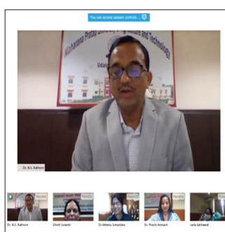
Hands-on training aims to make conditions as realistic as possible.

There is a great need for change and innovation due to technology and globalization. In order to enrich the practical knowledge of the students, in-plant training is mandatory.