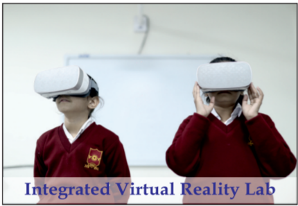
Integrated Virtual Reality Lab