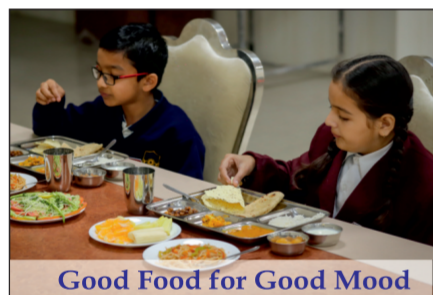
Good Food for Good Mood