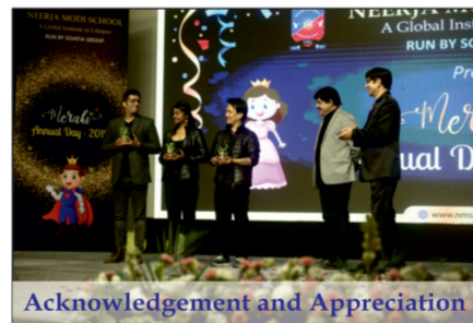
Acknowledgement and Appreciation