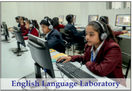
English Language Laboratory