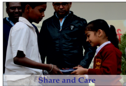
Share and Care