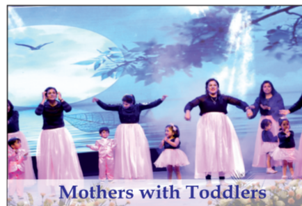
Mothers with Toddlers