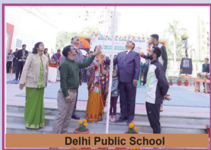
Delhi Public School