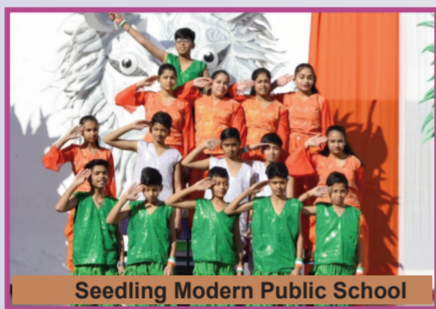
Seedling Modern Public School