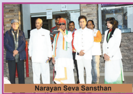
Narayan Seva Sansthan