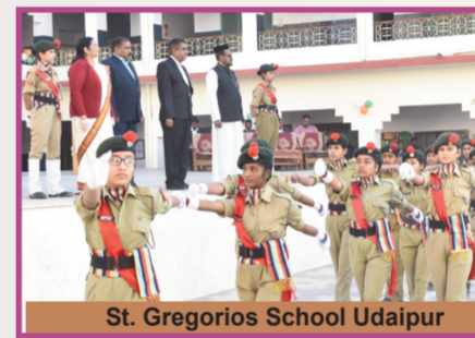
St. Gregorios School Udaipur