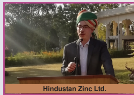
Hindustan Zinc Ltd.