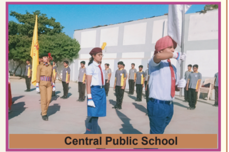
Central Public School