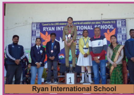
Ryan International School