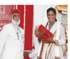
Ms. P.T. Usha Calicut, 2016

Award details and the prescribed application format can be downloaded from http://www.eternalmewar.in/collaboration or can be obtained free of cost from the Office of MMFAA, Udaipur. Please submit on or before 30th November 2019.