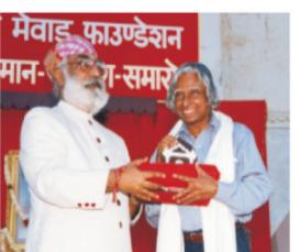
Prof. A.P.J. Abdul Kalam Chennai, 2002

Panna Dhari Award (Instituted in 1997-98)