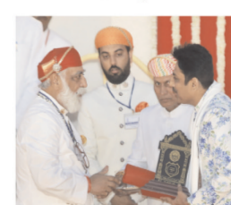
Mr. Shailesh Lodha Mumbai, 2017