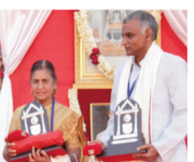
Dr. Mandakini - Dr. Prakash Amte Hemalkasa, 2012