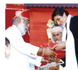
Mr. Amitabh Bachchan receiving the award on behalf of his father Dr. Harivansh Rai Bachchan Mumbai, 2001

Hakim Khan Sur Award (Instituted in 1986-87)