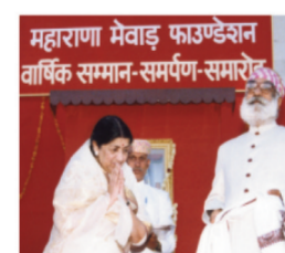
Ms. Lata Mangeshkar Mumbai, 2002