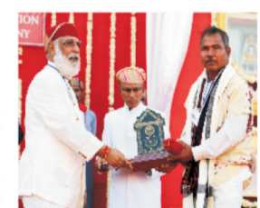
Mr. Jadav Mulai Payeng, Jorhat Assam, 2015