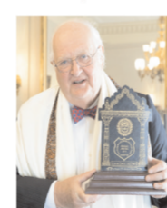
Professor Sir Angus Deaton USA, 2017