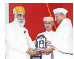
Mr. Kisan Babu Rao (Anna Hazare) Pune, 2004

Maharana Udai Singh Award (Instituted in 1996-97)