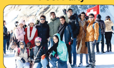
Student Exchange Program