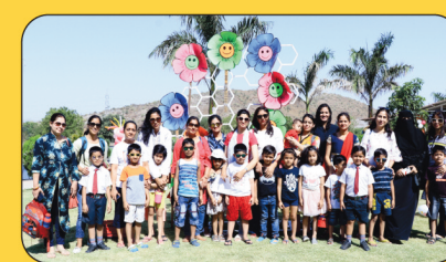
Mothers Day Celebration