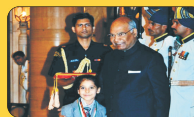
National Child Award - 2017 by President of India