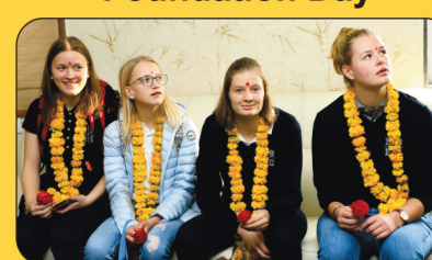
Student Exchange Program