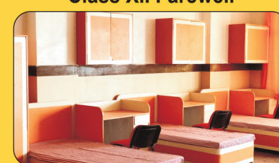
Hostel Facility for Boys