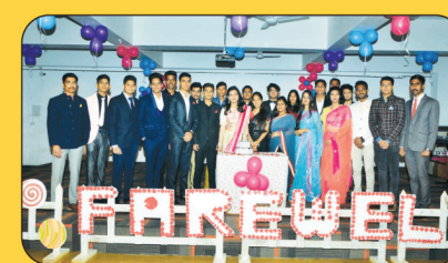
Class XII Farewell