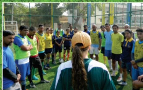
International exposure to Coaches