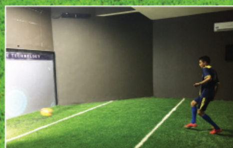
F-Cube Technology at Zinc Football Academy