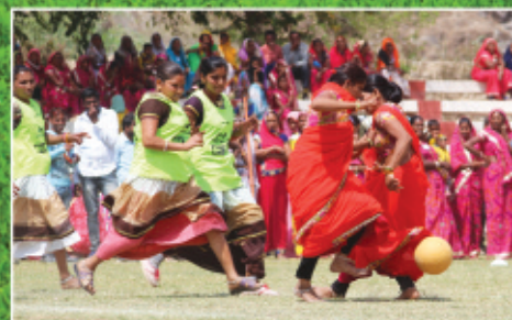
Sakhi Women playing Football