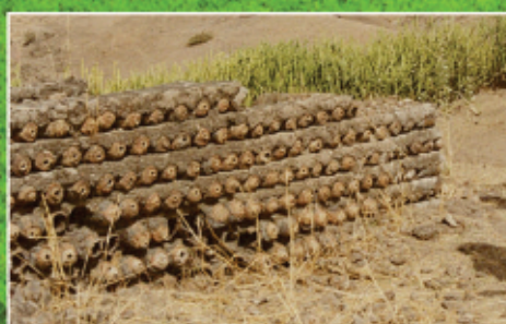
2500 years old carbon-dated Zinc retorts at Zawar