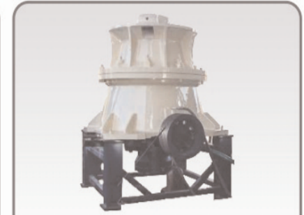
"KINGSON" Cone Crushers