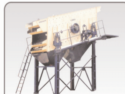
"KINGSON" Vibrating Screens