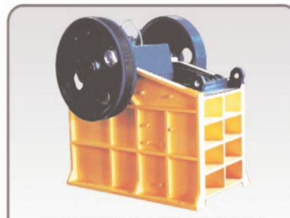
"KINGSON" Single Toggle Grease Jaw Crusher