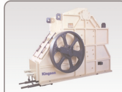
"KINGSON" Double Toggle Oil Jaw Crusher