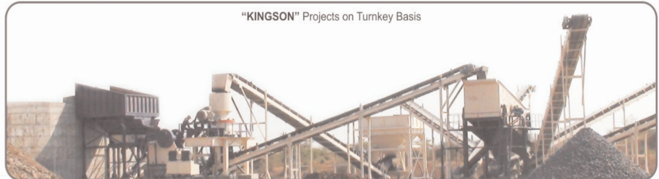
"KINGSON" Projects on Turnkey Basis