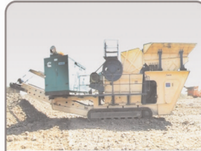
"KINGSON" Mobile Crushing Plant

MANUFACTURER OF CRUSHING SCREENING & SIZE REDUCTION EQUIPMENT