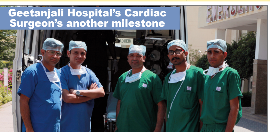
resulting in sudden & severe abdominal pain and collapsing to which he was brought to hospital in emergency conditions. The resultant bleeding into the peritoneal cavity is so rapid that exsanguinations and death usually occur before the patient reaches the hospital. But the patient was fortunate enough to reach Geetanjali Hospital where he was shifted for surgery without delay. The blood pressure of the patient was ranging in between from 60 to 70 with hemoglobin only 5 grams.

was replaced by an artificial artery with 5 to 6 blood units during the surgery to maintain the hemoglobin of the patient". Dr. Gandhi also said that, an abdominal aortic aneurysm is an enlarged area in the lower part of the aorta, the major blood vessel that supplies blood to the body. Because the aorta is the body's main supplier of blood, a ruptured abdominal aortic aneurysm can cause life-threatening bleeding. Also the ruptured abdominal aortic aneurysm is one of the most fatal surgical emergencies, with an overall mortality rate of 90% & only 10% survival rate. Since the patient is a very active person with a daily routine of walk, a good swimmer of time & a healthy diet consumer but still was diagnosed with such medical complications.