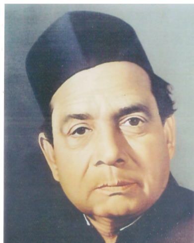
Padamshree Devi Lal Samar Birth - 30 July 1911 Death - 3 December 1981