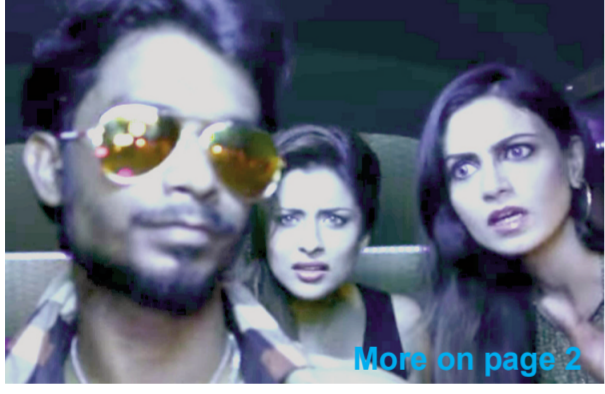
More on page 2