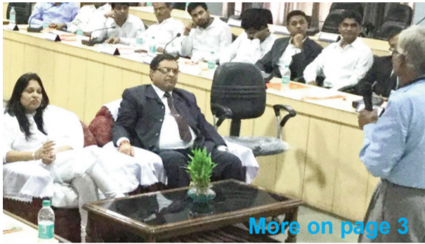
More on page 3