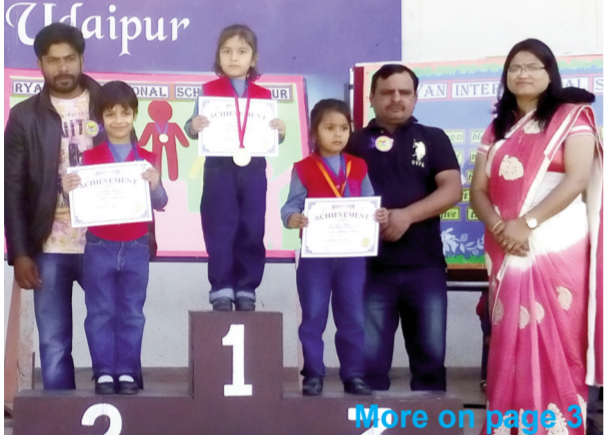
More on page 3