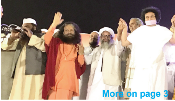
More on page 3