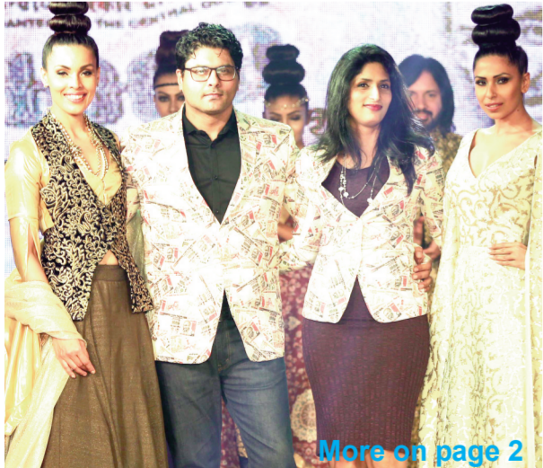
More on page 2