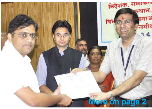
More on page 2