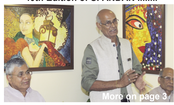
Orientation Programme held....