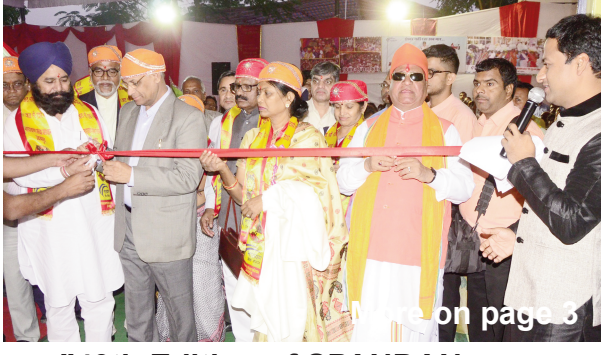
'40th Edition of SPANDAN .......