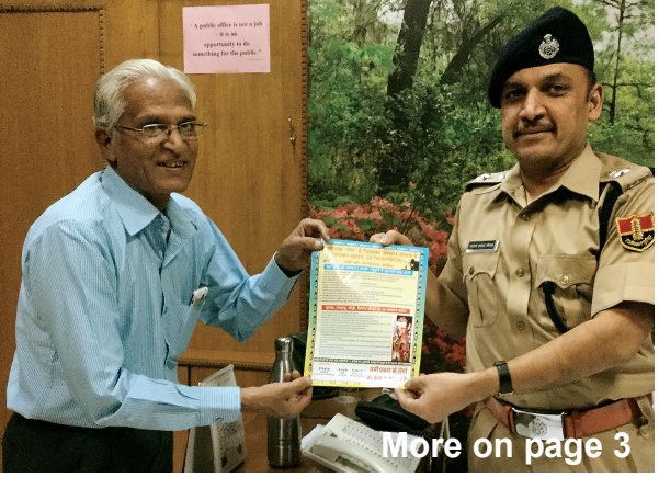
Parliamentary committee visited.....